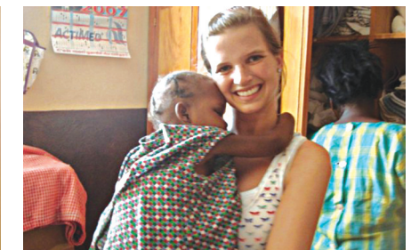
A smile from Haiti, where our student cares for an infant.