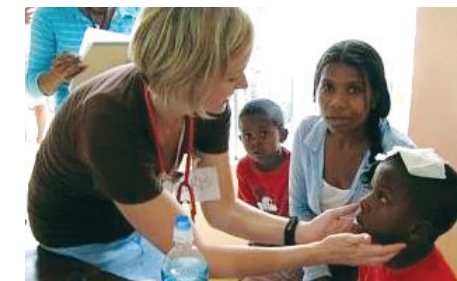
Our student cares for a family in the Dominican Republic during a medical mission trip.